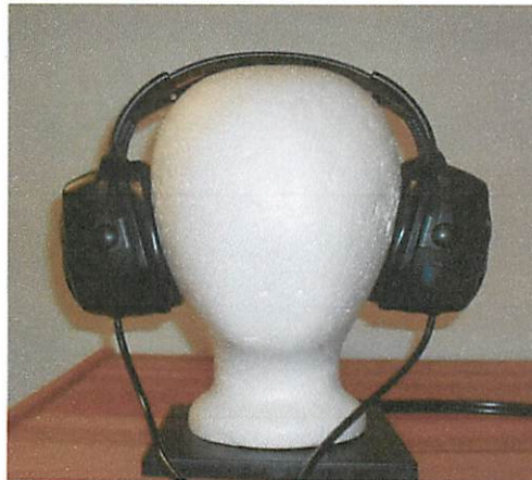
Test Item: Q4261A

These data were obtained through measurements made at the laboratories of Michael & Associates, Inc., State College, PA , USA. Michael & Associates, Inc., is accredited to test to ANSI S3.19-1974, ANSI S12.6-2008, ANSI S12.42-2010, EN352 parts 1-8 and AS/NZ S1270:2002 by the National Institute of Standards and Technology (NIST) National Voluntary Laboratory Accreditation Program (NVLAP).